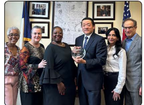
INTERFAITH MINISTRIES RECOGNIZING REP. WU AS THE 'MEALS ON WHEELS LEGISLATIVE CHAMPION' FOR THE 88TH SESSION