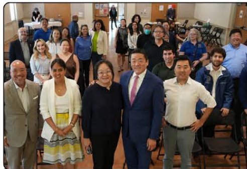
THE RACE EPIDEMIC SCREENING: REP. WU ALONG WITH JUDGE MONICA SINGH AND COMMUNITY MEMBERS AFTER THE SCREENING